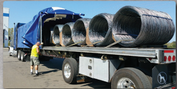
It almost Rolls by itself, it's so easy!