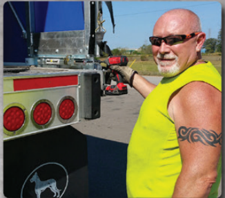
Impact Gun locks system and applies tension