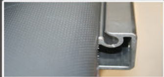
"Patented" Internal Tarp Connector Extrusion