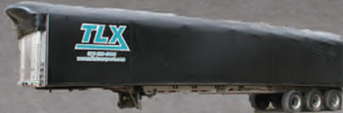
Slide Kit – Round Top Steel Hauler Systems