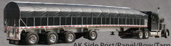
AK Side Post/Panel/Bow/Tarp System