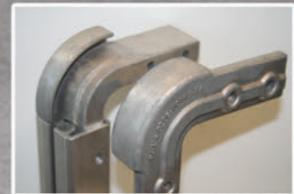
"Patented" SQ. Corner Connector Casing