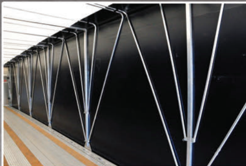
Quad Up-lifting Bows minimizes tarp pleating