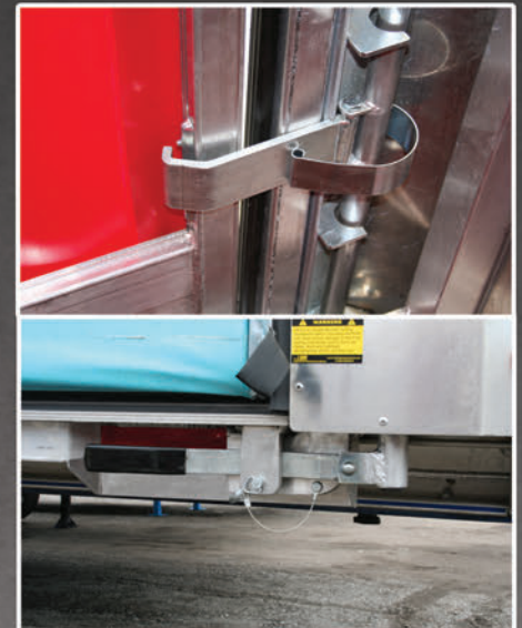
Ground Operated Interior Front Locks