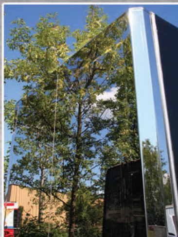
Mirror Stainless Bulkhead