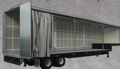
ALCS Hard Roof/Soft Side Curtain System