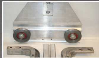
"Patented" Modular Frame System