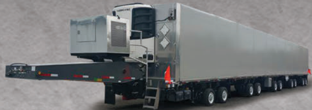
Over-Dimensional Load Covering System