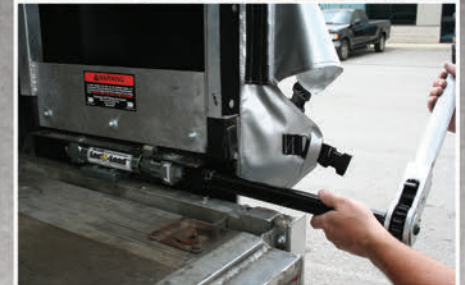
Loc'N-Load "Patented" Rear Lock & Tensioning System