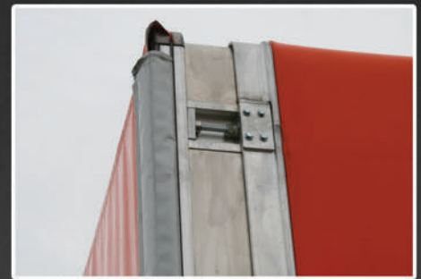
STAM - Slack Tarp Adj. Mech.