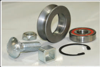
V-Grooved Metal Wheel w/Life Time Warranty