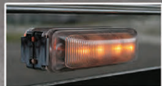
Mirror Stainless Lightbar