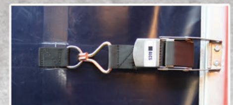
Rear Flap Buckle Assembly